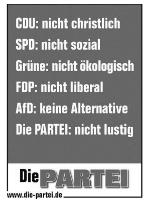
Figure 3: Die PARTEI poster about other parties

Source: Glied & Szegedi 2024: 502 'CDU: not Christians, SPD not social, Grüne: not ecological, FDP: not liberal, AfD: not alternative, Die PARTEI: not funny'