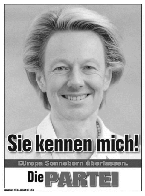
Figure 4: Die PARTEI EP election poster (2024)

'You know me! Leave Europe to Sonneborn.'