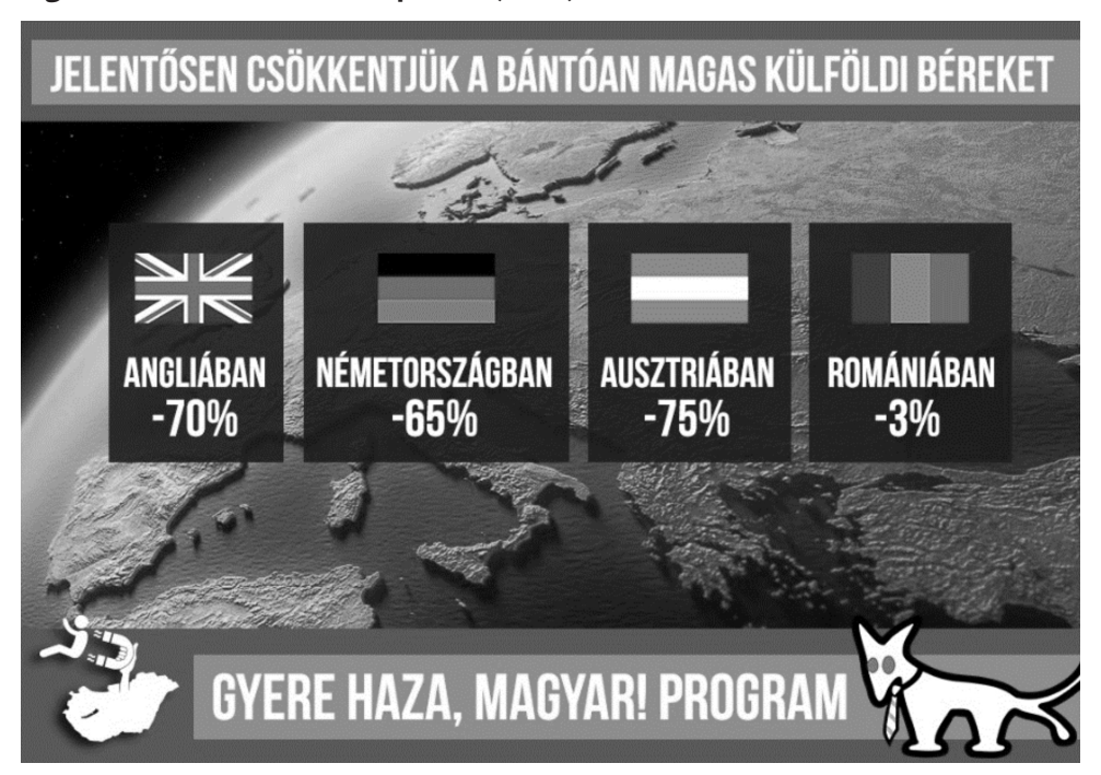
Figure 2: MKKP EP election poster (2019)